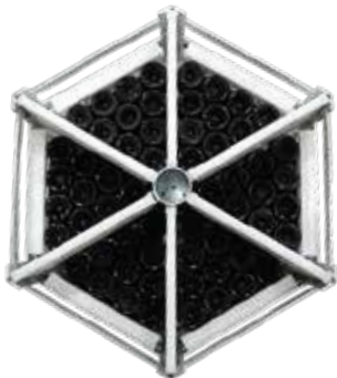
Holding system for traditional bottles