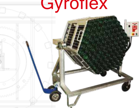
Gyroflex with traction bar