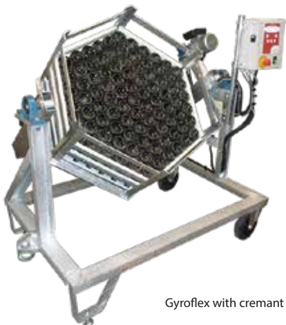
Gyroflex with cremant bottles