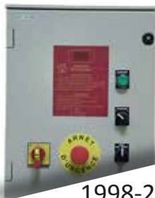
1998-2008 ACAI-S V1