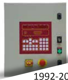
1992-2004 ACAI V1 AND V2